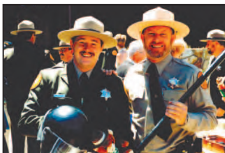
Modern ranger felt dress hat on left and straw summer hat on right. The ranger hat has a leather hat band that is tooled with the lettering "State of California" along with grizzly bears and poppy flowers around the band.